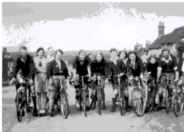
Jubilee Club Run in the New Forest 1935